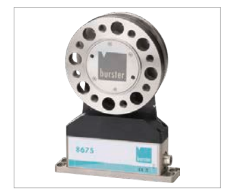
Rotor with stator